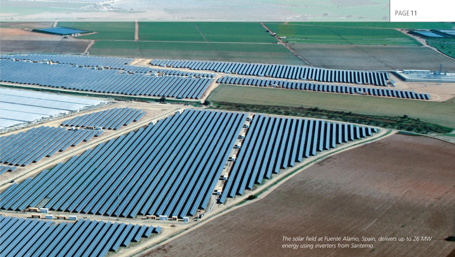
The solar field at Fuente Alamo, Spain, delivers up to 26 MW energy using inverters from Santerno.

documentation of model and code can be extracted and integrated in specification and design documents as part of the documentation process.