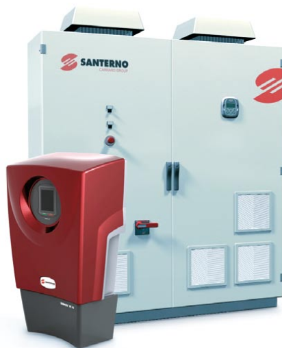
The SUNWAY™ TG 600V and the SUNWAY M are examples of the inverter product line-up, equipped with control software generated by TargetLink.

The exploitation of natural energy sources requires efficient electrical devices. Part of the job is using inverters to convert direct current (DC) to alternating current (AC). Santerno's inverters are equipped with controllers that ensure the greatest possible efficiency. Santerno has set up a development process that uses model-based design and automatic code generation for all controllers in the solar and wind energy application fields as well as in industrial automation. The experience from many production projects is that the benefits of using the dSPACE TargetLink code generator helped the company to meet its high time-to-market and quality objectives. The development department therefore aims to extend this approach to all new product developments.