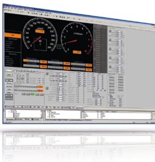
Direct control and visualization of ACC signals in ControlDesk.